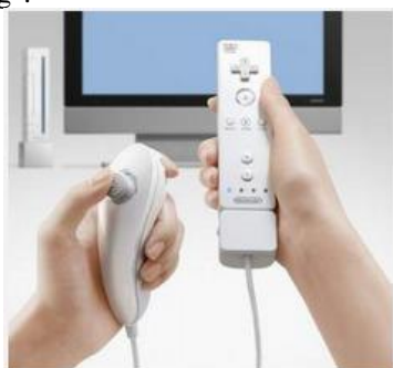
Figure2. The Exterior of Wii

Users control the screen depending on the Wii, not yet completely done by hand. But the unprecedented use Wii controller, life information content unrelated the game and other features and services, opened a "revolution in mobile gaming".