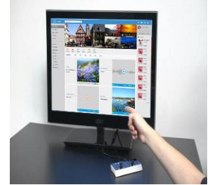
Figure7. DUO and Application