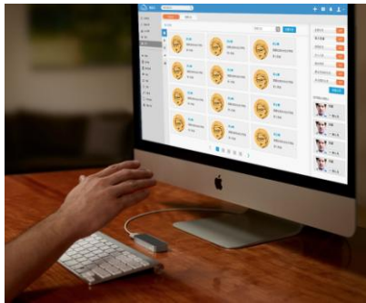
Figure6. Leap Motion Application

Leap Motion provides motion capture of three axes, and now the use of these applications are only two axes, the data of "depth" has not used.[10] Can imagine that, if holographic display technology will be practical in the future, Leap Motion would be very good interfaces between real and virtual.