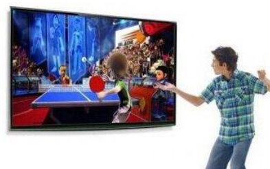
Figure5. Kinect Application