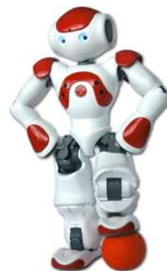
Fig. 1 The NAO Robot Controlled by Our Artificial Brain