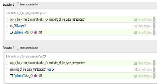
Figure 3. Example of Inference Result Explanation.

Based on the inference engine, the reason of inference result can be explained. There were two ways to explain why CC_Step of " step_of_live_oyster_transportation " is also an instance of CCP , as shown in Fig.3.