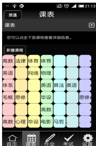
Fig. 4-1 Curriculum management Homepage

As shown in Figure 4-5 and 4-6, homework management module and test management module is basically the same, are the same layout as the first screen showing the current homework and exams, and sorted according to the time before and after. Click Browse all homework / exams can enter the corresponding interface, browse all homework / exams.