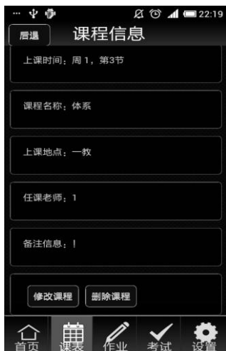
Fig. 4-3 Course Information