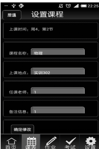
Fig. 4-4 Modify Course