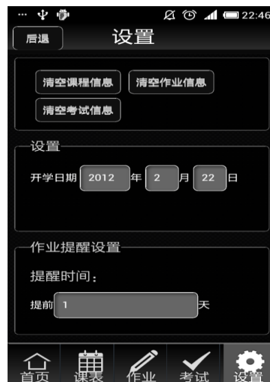
Fig. 4-7 System Settings

As shown in Figure 4-7, in the System Settings page, the operation is simple, you can set the start date, homework alert, the exam questions. Also on this page you can initialize the database, clear all data.