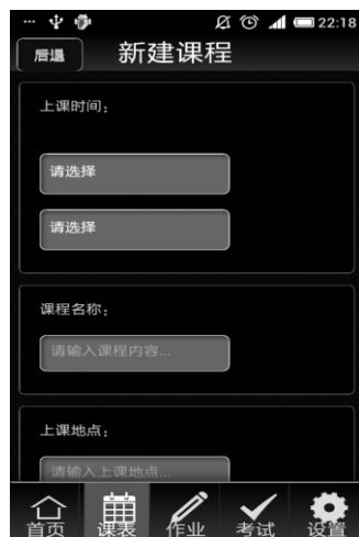
Fig. 4-2 Create Courses