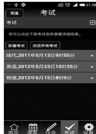
Fig. 4-6 Examination Management Page