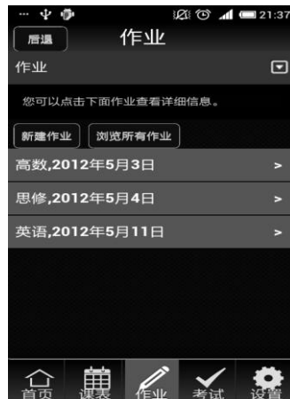
Fig. 4-5 Homework Management Page