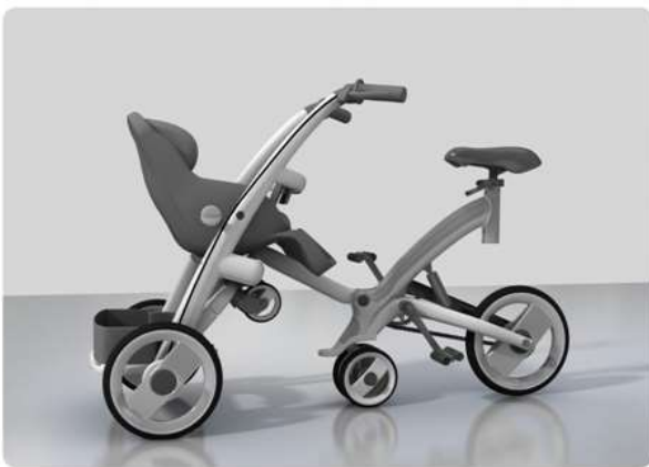
Figure3 Bicycle for mother and children

1、Bicycle for mother and children: using the Reverse Design Principle of TRIZ, put the children in the front for the mother to take care convenient, this bike Mothers can use this bike take their babies go shopping and do other activities in near distance, this product is low carbon safety and convenient. This function can be used in children 0-2 years of age, and then older children don't like to stay with the baby carriage.