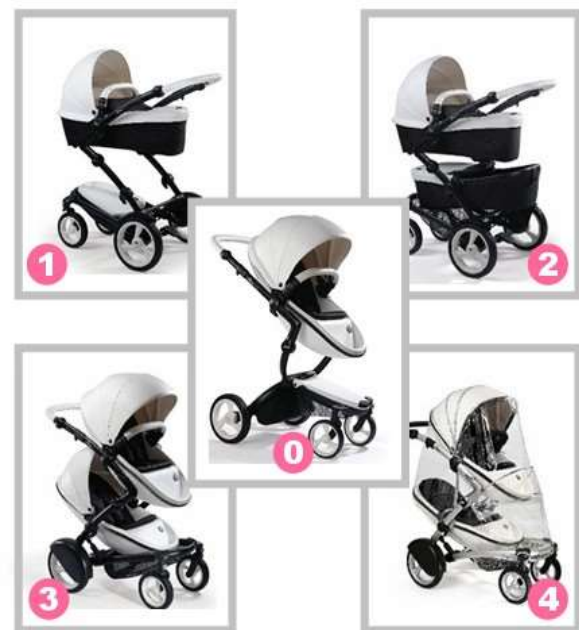
Figure 1 the multi-function at the same time of MIMA Baby carriage

These advantages improve both the product quality and the update of products. And it was convenient both the repairing and recycling. But dose the users use all of the functions at the same time? How frequently dose they use the different functions?