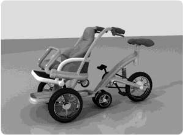
Figure7 the Car safety seat was independent and removable

3、 Car safety seat: A car safety seat in this baby carriage was independent and removable. Car safety seat can be used continue to the children 0-8 age, as shown in Figure7