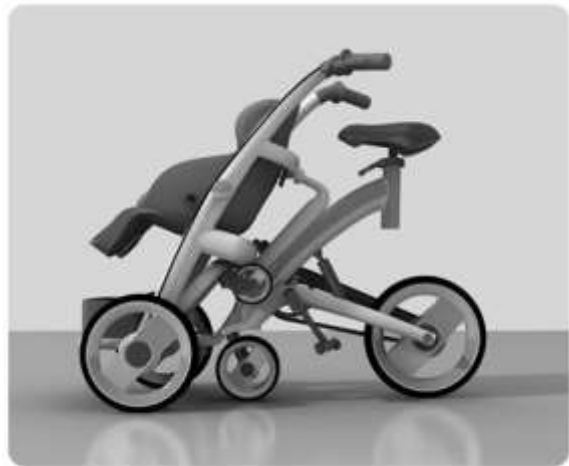
Figure5 the specific combination for space saving

The product when not in use, how to effectively save storage space. We use the folding methods in design, to solve this problem, as shown in Figure5.