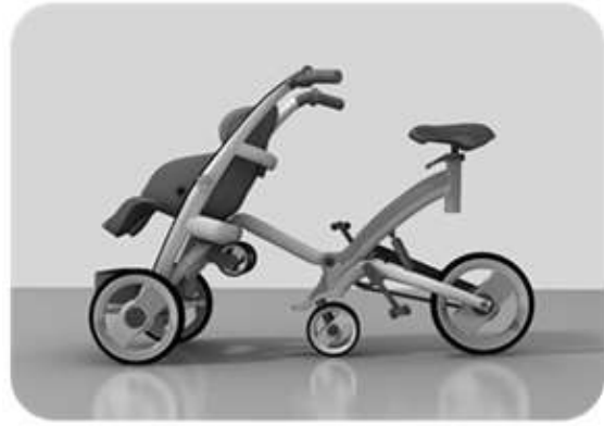
Figure4 Flexible installing modes of the seat

The product when not in use, how to effectively save storage space. We use the folding methods in design, to solve this problem, as shown in Figure5.