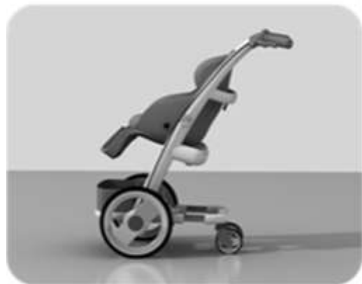
Figure6 baby carriage function

2、Baby carriage: a baby carriage in the Bicycle for mother and children was independent and removable. It can be used continue to the children 0-5 age, as shown in Figure6.