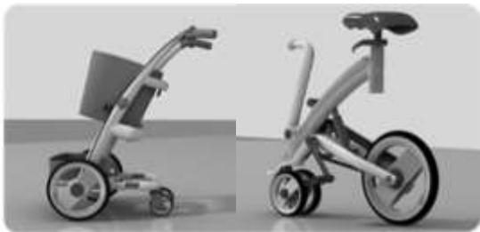
Figure8 Shopping bicycle

4、 Shopping bicycle: When the children grow up, the bicycle function can be transformed to the shopping, and it can provide for the elder children to use, as shown in Figure8.