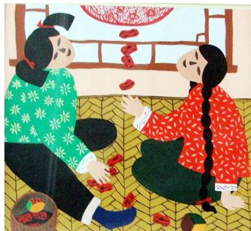
Picture.2. Playing Gachuha