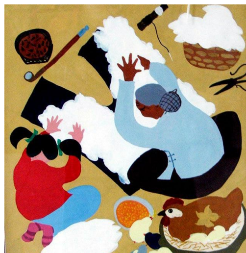
Picture.3. Making Cotton-padded Trousers

Farmers' paintings are paintings created in the process of productive labor. Farmers cannot live without labor or land. Farming and harvesting are the chief activities of the year. China is a big agricultural country with large population in rural areas. People desire to have ample food and clothing and look forward to favorable weather throughout the year and a good harvest. After the autumn harvest, clusters of red pepper, full flap garlic and golden corn are hung in the farmyard and around the house, symbolising a good harvest. The farmers use the harvest as goals and aspirations. Therefore, they choose labor and harvest as the theme of painting in leisure time. The colors of the picture are mainly red and yellow which symbolize golden autumn and harvest. See Suiling farmers' paintings "Harvesting corn" (picture 4), "Threading peppers" (picture 5), "Harvest" (picture 6). These paintings depict the lively scenes and joyful mood of the people. The painters used red and yellow as the main hues to express the inner joy and happy feelings. The full composition and plain patterns manifest the harmonious beauty in labor. The corn, peppers, grains and clothing reflect the regional characteristics and cultural connotation of Heilongjiang farmers' paintings vividly and distinctively.