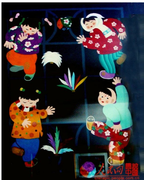
Picture.1. Kicking Shuttlecock