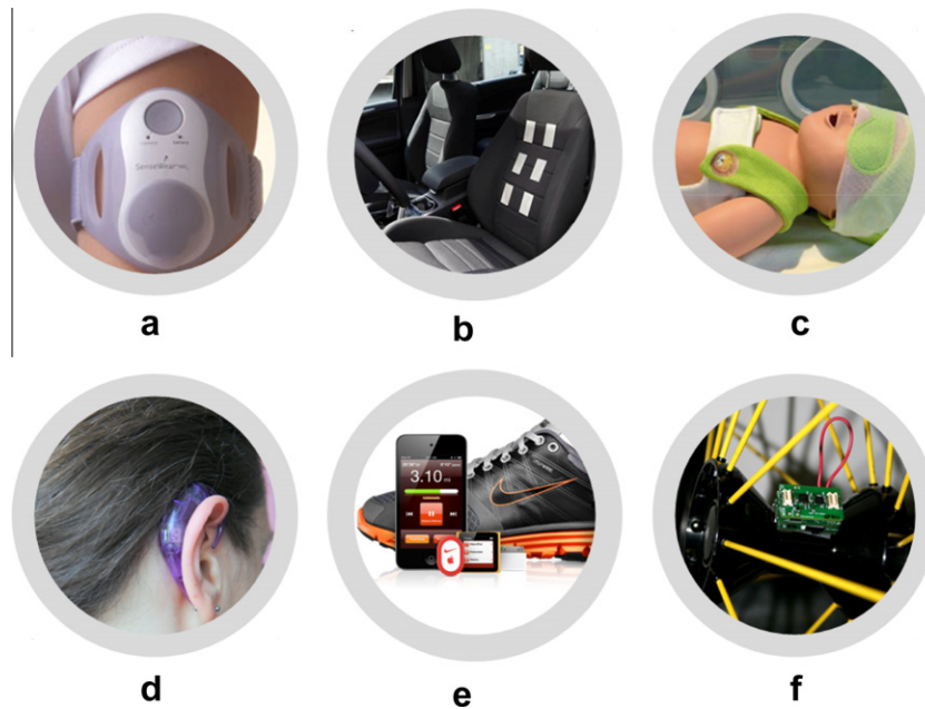
Fig. 2 Sensors that can be embedded in everyday surroundings: (a) the Sensewear armband; (b) ECG monitoring on a car seat; (c) a sensor-jacket for neonatal monitoring; (d) an ear worn activity recognition sensor; (e) the Nike+ipod shoe-based sensor for monitoring running; and (f) a sensor to observe wheelchair motion and paralympic athlete performance.

simple mobile phone programs, such as the iStethoscope, 9 can potentially help with tracking the trend of chronic heart disease in the world population.