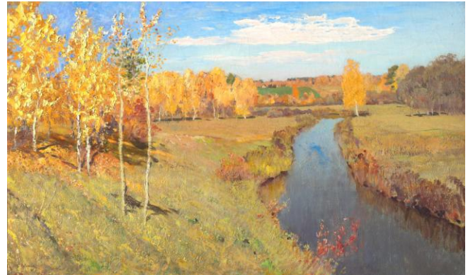
Pic. 3. "Golden Autumn". Isaac Levitan. 1895.

Pushkin was so deeply elaborated on later in his poem "Autumn" (1833): "Oh, mournful season that delights the eyes, // Your farewell beauty captivates my spirit. // I love the pomp of Nature's fading dyes, // The forests, garmented in gold and purple..." [4]. The unique image not only reflects the charm and beauty of Russian autumn, but also inspires many artists. This image is most precisely reproduced by Isaac Levitan in his picture "Golden Autumn" [5], whose name is an obvious reference to Pushkin's works (Picture 3).