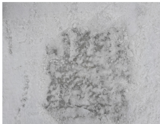
FIGURE I. SNOW REMOVING EFFECT OF NORMAL PAVEMENT

At the beginning of snowfall, the pavement temperature is slightly higher than the air temperature so that the snow melts after landing and cannot form accumulation. However, as the temperature continues to drop and snowfall increases, the pavement temperature decreases so that the snow melted before permeated into the texture depth and freezes into ice. This completely eliminated the friction force of the pavement. While the manual cleaning was conducting, it was found that the ice layer bound with the pavement texture depth very closely and very hard to remove. Moreover, after the snow was removed, the pavement became wetter and more slippery. On the other hand, for the anti-icing coating pavement, the snow was very easily to remove since there is a layer of water film between the ice layer and the pavement texture depth.