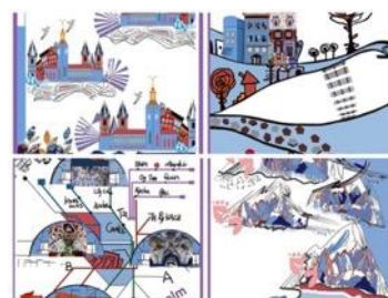
Fig. 8 Pattern design

Pattern is one of the biggest highlights of this series of design, with the help of modern digital printing technology to express. Digital printing is divided into inkjet printing and transfer printing, because the main fabric is composed of 100% polyester components, so the transfer printing process is better.