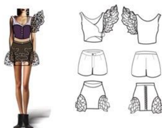
Fig. 11 3D printing garment design effect