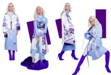
Fig. 10 Series product effect