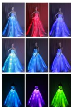
Fig. 6 Dress effect in variety of luminous state