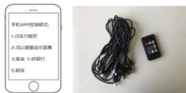
Fig. 3 Smart phone control and remote control

just like a normal dress skirt. It can be controlled by mobile phone APP or special remote control to make the dress emit colorful light according to different modes of control.