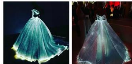
Fig. 1 Zac Posendesigned high-tech dresses

Luminous fiber fabrics experienced the red carpet at the 2016 Met Gala. Zac Posen used transparent organza containing fiber as the luminous material, and sewn 30 mini batteries inside the skirt to provide light source energy for the dress, which is very novel and beautiful. Luminous fiber fabrics are widely used in home textiles, such as curtains and tablecloths. It is also possible to use a small battery powered by a wire for clothing, which is equipped with a small battery that can power for eight hours to make it glow. In addition, there are many small USES of luminous fiber fabrics, such as the layout of nightclub scene and some safety works.