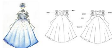
Fig. 2 Design draft of luminous dress with fiber optic fabric

In this study, luminous dress is taken as a case of cross-boundary design of scientific and technological materials and clothing. In combination with the fashion trend of 2018, designed luminous dress with large skirt. In terms of fabric design, luminous fiber fabric is adopted, which is composed of 60.8% polyester fiber, 28.2% new synthetic fiber and 11% nylon fiber. Luminescent fiber fabric is a kind of high-tech textile fabrics, the luminous fabrics based on the use of an optical fiber, the optical fiber can be combined with all of the natural fiber or chemical fiber, textile into all kinds of textile fabrics, and can meet the requirements of the textile process after finishing, the fabric is the main reason of the light supply a current of low voltage of 3.6 V.