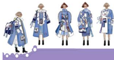
Fig. 7 Series of clothing design draft

clothing style, refined in 2018 of the latest popular element and color, extract the Stockholm city inspiration on clothing design elements, design four different patterns in the form of illustrations, combined with modern digital printing technology and computer embroidery technology, build a rich texture of plane and solid visual effect.