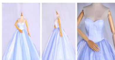
Fig. 5 Dress natural light effect