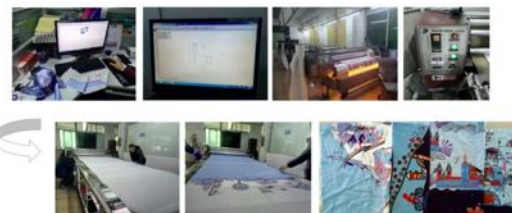
Fig. 9 Digital transfer printing process

Transfer printing is a printing method in which dyes or coatings are printed on paper to obtain transfer paper according to pattern patterns, and then dyes on transfer paper are transferred to textiles under certain conditions. At the very beginning of printing, the patterns are edited and modified by the computer for different degrees of color matching, and the pattern samples are printed. After confirmation, the four pattern specifications are typesetting, and the cloth is 15 meters long. The pattern is printed on the transfer paper, and then the machine is adjusted to 235 degrees for pressing. The transfer paper and the fabric are pasted together face to face, and the pattern on the paper is transferred to the fabric..