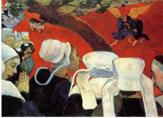
The Vision after the Sermon (Jacob wrestling with the Angel) 1888

It can be seen that he used more and more single and pure colors in painting, and his descriptions of the shapes of objects became more and more concise. Most of his paintings were painted in warm colors during this period.