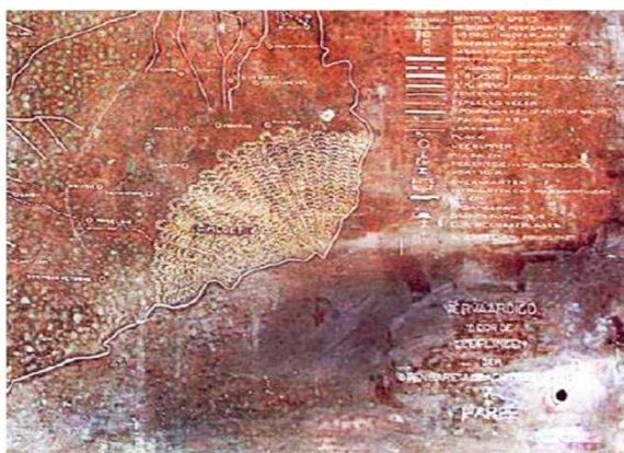
Fig. 1. The map of Overzichtskaart van Regent Regentschap Kediri 1933.

Every conflict always has a triggering factor [21], [22], [23], likewise conflicts linked to the border on Mount Kelud. The trigger factors are political policy aspect and economic interest aspect. The first factor is from the aspect of political policy. After the issuance of Decree of Governor of East Java Number 188/113 / KPTS / 013/2012, both parties have not reached agreement even the problem becomes murkier. This is because the decree is one-sided and only benefits Kediri regency. After a review based on boundary guidelines, a procedural flaw was found, ie the determination of a decision letter technically did not meet the geodetic aspect. This is reinforced by research conducted by, which is based on a study of regional border analysis using historical map in the colonial period, namely the map of Overzichtskaart van Regent Regentschap Kediri 1933 (picture 1); Map of Den han 1840 Collection from National Archives of RI (picture 2); Map of Kaart Van de Residentie Kediri 1891 (figure 3); Map of 1879 Tropograpische Kaart Der Residentie Kediri (picture 4); Map of 1929 Overzichtskaart Van Java en Madoera (picture 5); and Map of 1945 Bladwizer Van Java, Madoera En Bali NR: 4 (picture 6), then the peak of Mount Kelud is outside the administrative region of Kediri and into Blitar Regency.