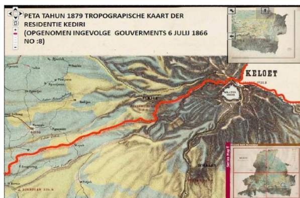
Fig. 4. The map of Tropograpische Kaart Der Residentie Kediri in 1879.

After the text edit has been completed, the paper is ready for the template. Duplicate the template file by using the Save As command, and use the naming convention prescribed by your conference for the name of your paper. In this newly created file, highlight all of the contents and import your prepared text file. You are now ready to style your paper; use the scroll down window on the left of the MS Word Formatting toolbar. Authors and Affiliations.