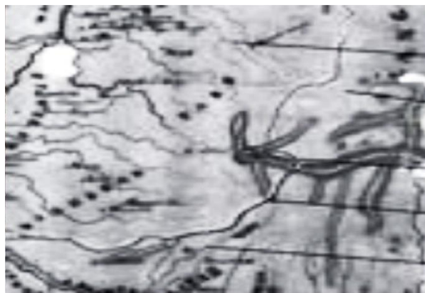
Fig. 2. Collection Map of Den han 1840.