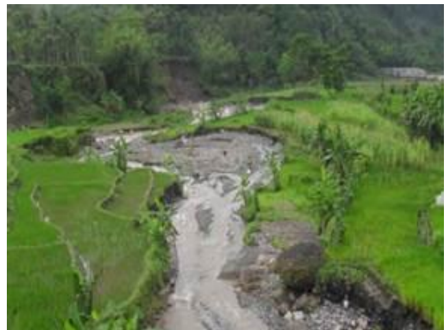
Fig. 2. Potential of mining C (Sand and Stone) in the Semut River, Gandusari District

History of eruptions in January 2014, status of Mount Kelud has increased status. Mount Kelud is stated to show turmoil that all communities must watch out for it. On February 13, 2014 at 9:30 a.m. Mount Kelud was declared Siaga I status and residents within a 5 km radius had carried out massive evacuation. Shortly thereafter at 11:20 a.m. Kelud erupted [18]. The eruption did not last long, many people returned to their homes on February 18, 2014 [18]. Mount Kelud eruption did not cause casualties in the area of the Refuge Command Post. But it leaves a secondary danger: volcanic ash fall and volcanic lava eruptions. This volcanic ash fall erupted in Ngantang District and Pujon (Figure 3).