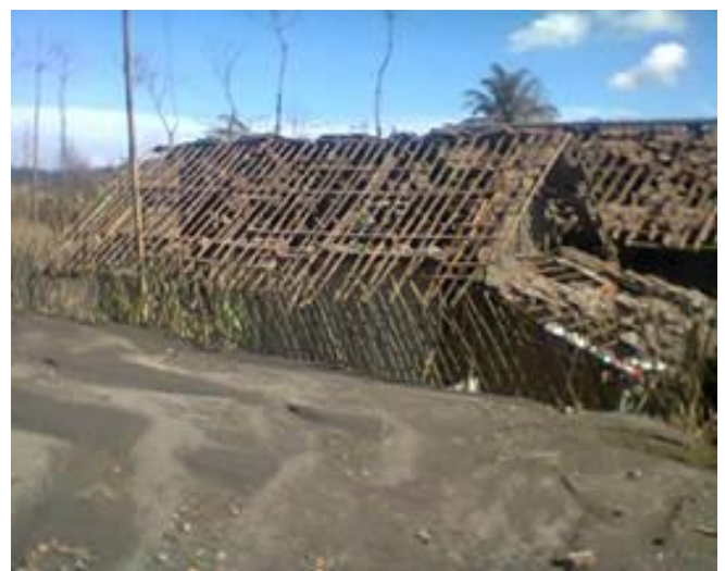
Fig. 3. Impact of Mount Kelud eruption on Ngantang and Pujon Districts Malang Regency

Education is the main key in increasing individual readiness in the face of disasters. The higher the education level the income tends to be higher as well [19]. The level of education will influence the level of individual knowledge