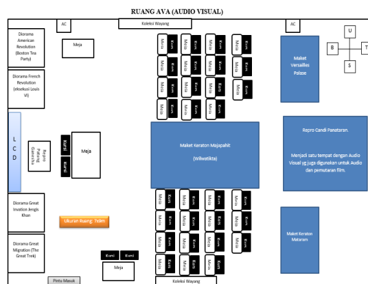
Fig. 1. Audio Visual Room

by the Department of Historical Education at the PGRI University of Yogyakarta, which are as follows: