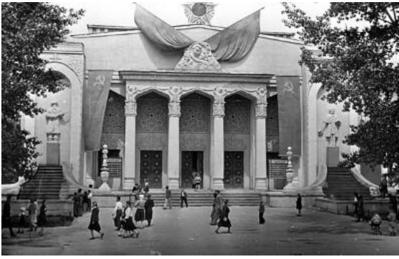
Fig. 2. Youth Theatre after reconstruction by architect N. Prostakov, 1944, foto by 1947 © Institute of Modernism, Moscow.

Thus, as we can see from the above and other examples, only “visiting” architects were involved in the search for, or more precisely, the construction of “national” features in the Kazakh architecture, combining this process with “developing the heritage” and decorating newly created classic facades and interiors with stucco mouldings.