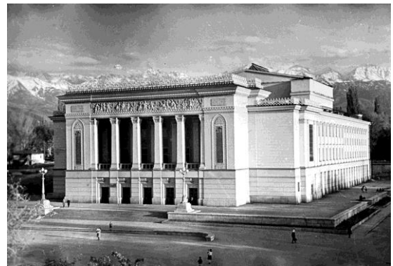
Fig. 1. Kazakh State Academic Opera and Ballet Theater named after Abai, 1936 – 1941, arc. N. Kruglov, N. Prostakov ©Institute of Modernism, Moscow.

An illustrative example of such a “hybrid” construction is the Opera House in Almaty, created by Russian architects N. Kruglov and N. Prostakov, designed and constructed in 1936-1941 (“Fig. 1”).