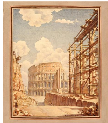
Fig. 4. Andrea Beloborodoff, The view of the Colosseum and the Temple of Venus under the reconstruction, 1936. Museo di Roma, Roma. Inv. GS — 12050

A singular case was that of Andrej Beloborodov (the Italianized name — Andrea Beloborodoff) [22, 23, 24], who emigrated from Russia in 1920. His career began on the eve of the Revolution and gave all the signs of prosperous future. Among Beloborodov's first clients there were the Imperial Court and Prince Felix Yusupov, thanks to whom the architect remained linking to the international aristocracy after emigration to Europe. After the solo-exhibition "Vedute di Roma e dell'Italia" at the Pecci Blunt Palace in 1934, he settled in Rome. The exhibition was hosted by famous collector Anna Laetitia-Mimm ìPecci and was composed of engravings and watercolors from the 1920s to early 1930s, already successfully exhibited in Paris. In Rome, Beloborodoff made a series dedicated to the demolition of the historic center, exhibited in 1936 at the Museum of Rome to his personal "La nuova Roma monumentale (immagini dell'urbe mussoliniana)", after that six works from the exhibition were acquired for the Museum's collection.