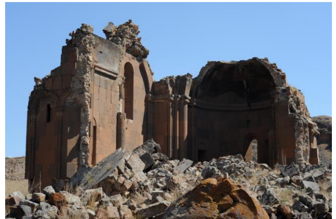
Fig. 3. Aghjkaberd Church, view from the South-East.

Aghjkaberd church falls into the category of churches, which have a rectangular outline and a cruciform interior space, crossed-dome termination of the nave and additional spaces in the corners ("Fig. 3").