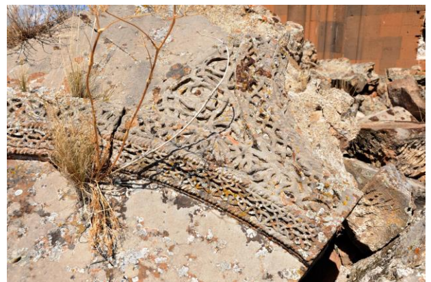
Fig. 6. Aghjkaber, collapsed fragment of the Southern façade.

Among the fragments of the destroyed wall a conglomerate of blocks with two archivolts of a blind-arcade, one of which is wider than the span and much higher than the second is of particular interest ("Fig. 6"). There is no doubt that the higher element of the blind-arcade belongs to its central field. The fragment of a rectangular frame with profiling and an ornament of intertwined diamonds and rings is preserved among the debris and. Most likely, it belonged to the central window of the Southern facade, which was located above the archivolt of the blind-arcade (similar to the reconstruction of the Bakhtaghek's church by T. Toramanian) [18].