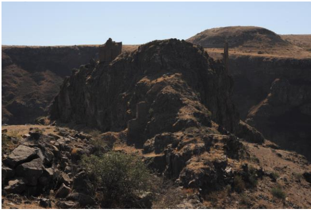
Fig. 1. Aghjkaberd, view from the Nord.

The church has been known to travelers, artists, and scientists who visited Ani even before the systematic study of the heritage of the settlement in the early 20th century by architect T'oros T'oramanian and the Russian Archaeological expedition under the leadership of Nikolai Marr.