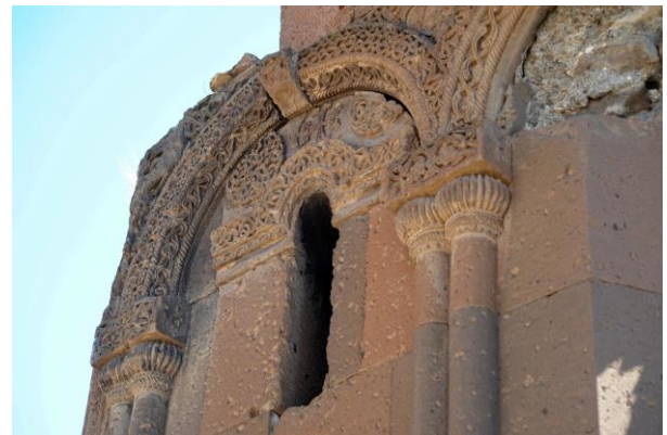
Fig. 4. Aghjkaber, a fragment of the arcade from the Northern part of the Western wall.

A fragment of the arcade from the Northern part of the Western wall is filled with diverse decorative elements. The arches are decorated with two ornamental ribbons running along the shelf and bevel. There are ribands that simulate tightly twisted braids running between them as on the lower edging of the arches. All this, as well as the filling decor of the spandrels, create the effect of a solid, a carpet ornament. Pattern ornaments varying for each archivolt are mostly presented in the versions of the narrow wavy double stems interlacing with other plant or geometric elements. So, in the left lower riband of the remaining arch, there is a simple undulating stem intertwined with the other one with its leaves. While in the upper riband of the same arch, in its left part, we find an ornament of closely intertwining rings and half-rings forming six-petalled "rosettes", slightly superimposed on each other, in the right part of the arch there is the ornament consisting of two symmetrically diverging wavy stems and intertwined semicircles of ribbons. In the second arch (half-arch) we find more complicated weaving. It's interesting how the architect solves the problem of ornamental alternating at the intersection of two arches: two different ornaments "untwine" the pattern of the main stems and intertwine together, tapering to an end to one curl ("Fig. 4").