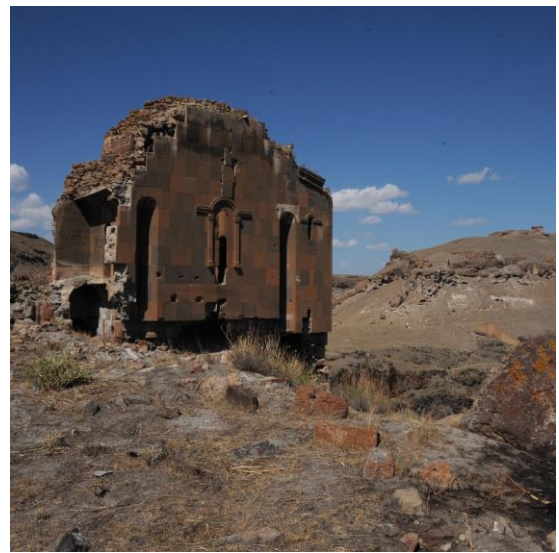
Fig. 5. Aghjkaber Church from the East.

The Eastern wall is decorated in the same strict manner. But here, as in most other Armenian churches, an altar window similarly decorated with an edge and columns is located below and flush with the ends of the triangular niches and decorated with a profiled edge of the side windows ("Fig. 5").