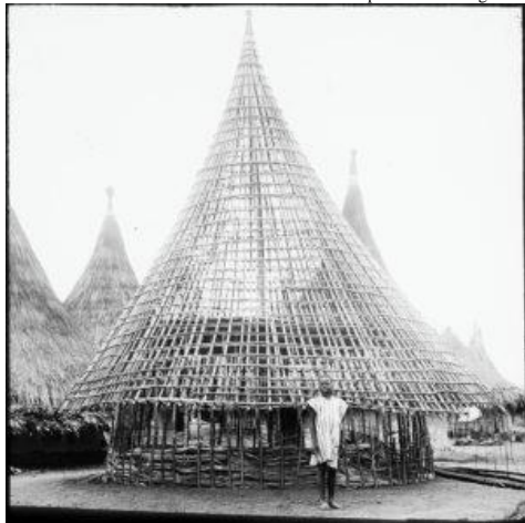
Fig. 4. Traditional home during ancient era.

a. source: https://en.wikipedia.org/wiki/West_Africa#/media/File:Map_of_West_Africa.gif and https://action10.org/ik-about-countries/