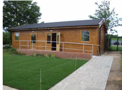
Fig. 22. Wooden House

Wood, one of the most readily available natural materials other than mud has been used extensively in Africa and many part of the World for centuries for almost all elements of its built environment of any nature scale of Complexities. The range of the methods of using wood, for a variety of building elements with simple as well as complex joinery details, in any historic settlement of these regions reflect the ingenuity of local craft persons in understanding wood as material. "Fig. 22" shows a modern design wooden/timber framed house.