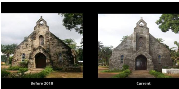
Fig. 17. The Miller McAllister United Methodist Church.

Modern Materials such as concrete, steel and glass are replaced the stone at many places but still in many rural areas where the stone is available in plenty and can be quarried easily, stone structures are seen in abundance. In modern buildings, stone come handy as façade materials. Many decorative features carved in stones are used as an aesthetic feature in modern constructions.