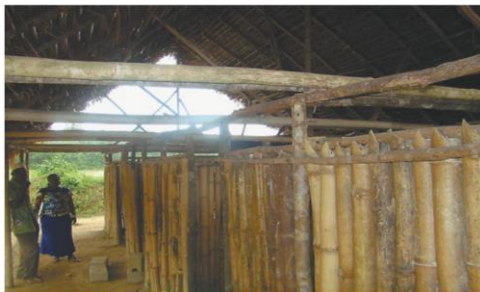
Fig. 21. This hut is used as a temporary school in the village of Nâ Jabacca in Liberia (Four hundred students attend the school).

Plywood Industrial Research and Training Institute, Bangalore- In collaboration with TRADA and BMTPC, they have developed a modified walling system with Bamboo-create an up gradation of wattle and daub system; and also a construction system for two story bamboo Structure.