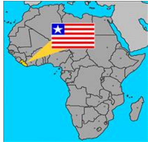
Fig. 5. Liberia location on the Map of Africa.

a. http://www.hpsol-liberia.net/architectural-history/