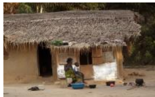
Fig. 13. Liberia house in Nimba County.

Mud is extensively used for Construction in rural areas as it is readily available and is widely accepted.