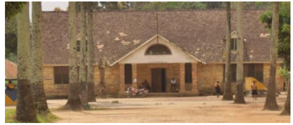
Fig. 18. Ganta United Methodist High School (Stone Building).

a. https://www.umnews.org/en/news/symbols-of-past-and-future-in-liberia-church