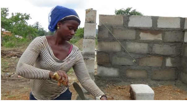
Fig. 16. Masonry Work.

In Liberia, masonry work is the leading method people are using to build modern design. It has adapted to our culture and norms. In “Fig. 13”, this lady learned this skill to be able to adapt to what society have to offer to life in Liberia.