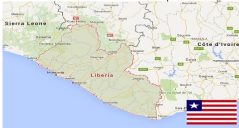
Fig. 3. Map of west Africa and Liberia.

a. source: https://en.wikipedia.org/wiki/West_Africa#/media/File:Map_of_West_Africa.gif and https://action10.org/ik-about-countries/