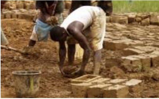
Fig. 11. Liberia: Gbaita villager making bricks in a wooden form.

mix is cast in open molds onto the ground and then left to dry out. Adobe bricks are only sun-dried, not kiln-fired. When used for construction they are laid up into a wall using an earth mortar.