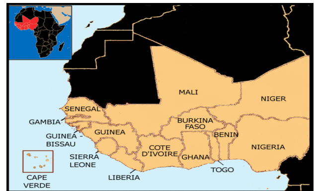
Fig. 1. Map of west Africa and Liberia.

Prior to the country's founding by African-Americans in 1822, the indigenous people of what was then the Grain Coast constructed their houses in the Sudanese style of African architecture. (See "Fig. 4") Village houses were rectangular or circular, seven or eight feet high, with conical roofs that rose to a peak in the middle. They had from one to six rooms, with the kitchen and bathroom being separate structures several yards from the house