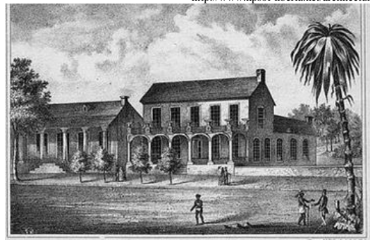
Fig. 10. President J. J. Roberts' residence actually looked like this in 1850.