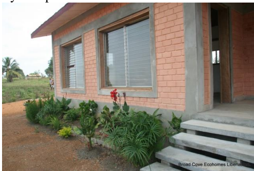
Fig. 12. Building Constructed with Adobe Bricks

1) Modern adobe brick : Modern adobe bricks consist of a mixture of clay, sand, straw, and emulsified asphalt. Clay holds bricks together just like the cement in a concrete block. It contains primarily an aluminum salt and is made up of extremely fine particles.