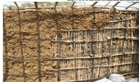
Fig. 14. Liberia house in Nimba County photo taken by Rebecca Dutton.

a. http://www.africavernaculararchitecture.com/liberia/