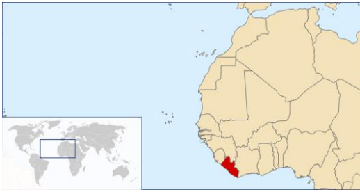
Fig. 2. Map of west Africa and Liberia.