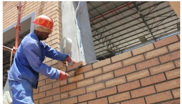
Fig. 19. Brick Construction.

2) Brick : The use of burnt clay bricks is widespread where wood or coal fuel is available. Clay brick is a traditional building material used for centuries in many parts of Liberia and the World. Stone is the locally available material in some regions. Bricks are inexpensive, lightweight, durable, easy to install, fireproof, low maintenance and could be easily ornamented. We can see the wonderful brick buildings constructing by Liberia Ever Green Group of Companies. The exposed brick work is bold example of how intelligently bricks are used in construction. Brick industry has developed a strategy to minimize the environmental impact of brick construction, increase its energy efficiency and use of renewable energies.