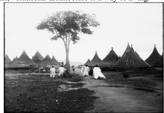
Fig. 9. Traditional home during ancient era, 1822.

materials can be adapted for the same materials and technologies. The first factor influencing the development of vernacular construction practices is related to the availability of local building materials. In many areas, the locally available resources have governed the use of the following constituent materials for walls simple plans, load-bearing walls, use of natural materials for construction. Overall, vernacular architecture is a way of living.