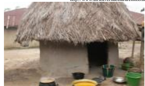
Fig. 15. Liberia house in Nimba County photo taken by Rebecca Dutton.

a. http://www.africavernaculararchitecture.com/liberia/