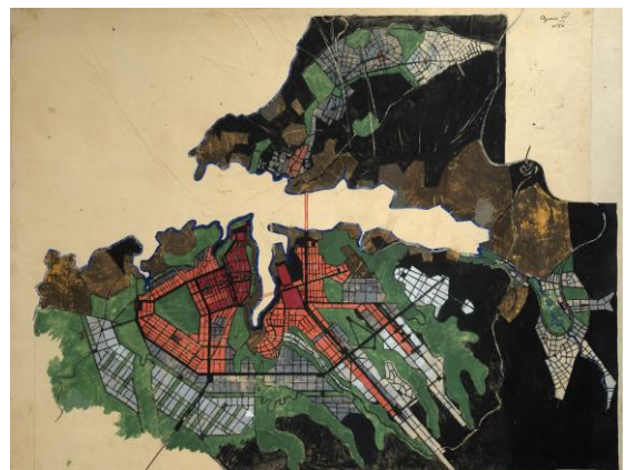
Fig. 3. Sevastopol general plan zoning. G. Barkhin, 1944-45.

street network and proposed new squares and public buildings. Despite the liberation of the city, Barkhin's General Plan was prepared before actual mine removal, bomb disposal and topographic mapping was completed. In fact, many actual planning decisions were made by new local architecture authorities — head architect Yuri Trautman (1909-1986) and his deputy Valentin Artyukhov (1931-1978), both Leningrad Construction Institute alumni. The General Plan of Sevastopol was approved by the Council of Ministers of the USSR in 1949 and was heavily based on the pre-war street-network, street-profiles, engineering infrastructure and even building foundations — however Sevastopol's architecture ensemble represents the best of Soviet postwar architecture. Sevastopol lacks gigantic scale of Soviet triumphant squares and long alleys, designed for "visionary spectator" as well as a huge "main building" in the image and semblance of Palace of Soviets (not only well-known Moscow designs but projects for Stalingrad, Novorossiysk etc.) [2].