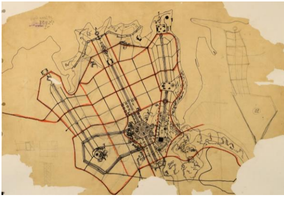
Fig. 1. Sevastopol general plan concept. M. Ginzburg, 1943.

Barkhin's proposal was selected and in future literature he was always named as the author of the city's General Plan (1946). Ginzburg, as we can judge by his sketches from the State Schusev Museum of Architecture's collection, relied on reports describing almost destruction of the city and proposed to form a new center not in place of the pre-war one but on the adjacent hill, and similarly sprawling northward to the bay's shore. He took the heavily damaged Sevastopol Siege Panorama Building as the origin of a proposed new street and boulevards network from the topmost point of the hill to the north-northwest direction for 2.33 km — one and half times longer than the historical Central City Hill. We do not know what he planned for the remaining part of the pre-war city but at that time the opinion of preserving it as historical ruins was discussed among various Soviet officials.