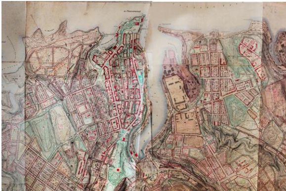
Fig. 4. Sevastopol General Plan fragment. V. Artyukhov, 1949.

Between 1946 and 1949 Artyukhov and Trautman refined Barkhin's proposal based on new topographical surveys and a detailed examination of the city's underground facilities – the sewage system, building basements and foundations, and underground catacomb galleries used as bomb-shelters. Valentin Artyukhov led this process due to his war-time experience (he served as a sapper during preparations to break the Leningrad Blockade (1942-1944). Observations made by his team show that the majority of building foundations survived relatively non-damaged and there was no need to rebuild the sewage pipes system laying below street pavement level (despite calculations proclaiming that each square meter of besieged Sevastopol received on average 1.5 tons of steel during bombardments). So, the decision was made — based on these assumptions and the direction of Leonid Polyakov (1906-1965), another master architect from Moscow – to restore the city on its existing prewar foundations. This 1949 General Plan worked until 1970 — a whole epoch of city resurrection, and many of Barkhin's principles regarding the city's sea-facade, street profiles and zoning [3] were not forgotten, but paradoxically, according to recent opinion of local architects, these principles were considered to be invented only by the "local" Trautman and Artyukhov [4].