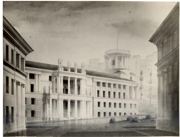
Fig. 6. Tchernomorets Design Bureau building. L. Pavlov, 1950-51.

Leonid Pavlov, a well-known master of Moscow modernist era architecture designed a monumental rotunda over the south wing of the nearly symmetrical Tchernomorets Design Bureau on Lazareva Square. The main building volume has a fine detailed ionic order in its central entrance and wing loggias. The rotunda placed over the square tower has upside down columns with the wide end on top — it resembles the order of Minoan palaces but with corner ionic capitols — a very artistic approach to an "unchangeable canon". Pavlov also designed a whole facade of the square's opposite side — he placed two smaller streets as well as courtyard openings to ionic order porticos of three-story apartment buildings standing in one row.