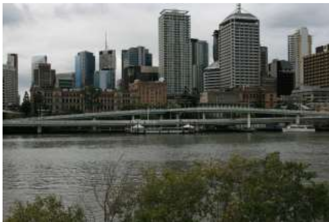
Fig. 3. Brisbane "cut off" from the river.