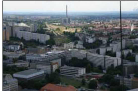
Fig. 1. Conversion areas in Leipzig.

differently by various authors. The first international discussion of these problematic areas can be considered the International Union of Architects Congress of 1996 in Barcelona, where they are combined into one typological group of related objects. (See “Fig. 1”)