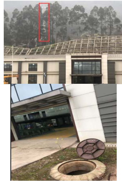
FIGURE IV. (A) MACRO BASE STATION OF EXPERIMENT LBS ; (B) TEST PIPELINE

As shown in Fig. 4(a) and Fig. 4(b), a larger place outside shall be selected as the test location to test the LBS positioning region. The pipeline of 400mm~650mm diameter with 3 bends and 8 obstacle points shall be installed. The experiment has two purposes: one is to analyze the influences of number of reference nodes on the positioning accuracy in the certain space range; the other is to analyze the positioning accuracies that can be reached with the same number of nodes in different space ranges.