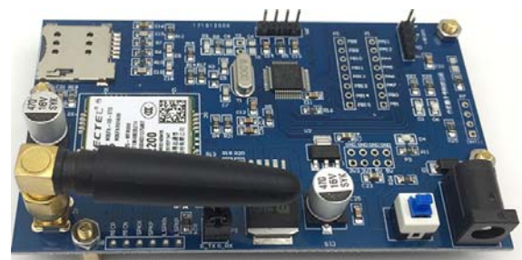
FIGURE II. MATERIAL MATTER OF DEVELOPMENT BOARD

Computer and network are connected through RJ45. Fig. 2 is the material matter of the STM32-SIM868 development board, in which the power input is supplied by the pipeline robot.