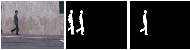
FIGURE II. COMPARISON

The first one is before processing, the second one is the result of VIBE algorithm, and the third one is the result of ghost elimination method proposed in this paper.