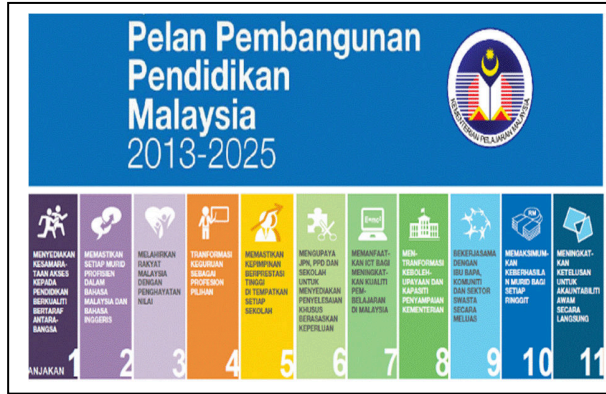
Fig. 1. Eleven shifts in the Malaysia Education Blueprint (Preschool to Secondary) 2013-2025, MOE5