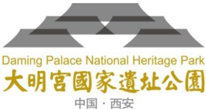
Fig. 2. Logo of Daming Palace National Heritage Park.

a) Brand logo : Logo is the visual expression of the brand of a scenic spot. The current logo of Daming Palace National Heritage Park (see "Fig. 2") shows the outline of the main buildings of the Park in a layered palace shape, condensed the magnificent momentum of the Tang Dynasty; and the Chinese and English names of the scenic spot are shown below the pattern, corresponding to the pattern and very recognizable. The logo is mainly gray and the color blocks are intertwined, indicating that the Daming Palace condenses ancient civilization and modern civilization.