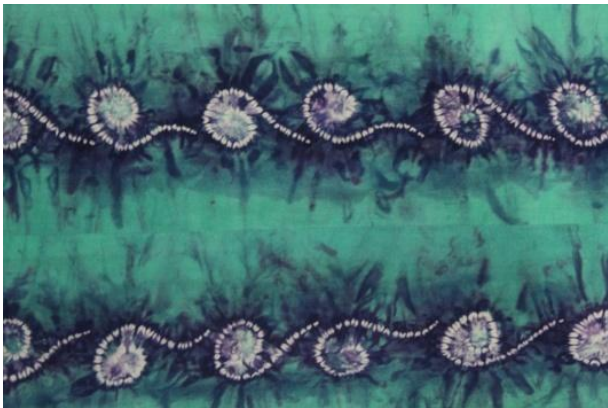
Fig. 4. Kambang Kacang motif

This motif has a characteristic where the ends are circular and can also face each other or line in the same direction. This motif variety can be seen in Figure 4.