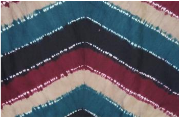
Fig. 3. Turun Dayang motif