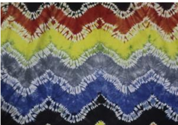
Fig. 5. A Motive for a Tooth and Diamond

This variety of motifs is taken from the name of a fish called Haruan fish or cork fish, which is one of the favorite fish of the Banjar community. These fish are usually black and have sharp and sharp teeth. The characteristics of the tooth of Haruan fish are taken as one of the Sasirangan motifs which means meaningful sharpness. While the variety of diamond motifs symbolizes a beautiful, has good behavioral meaning, courtesy, and virtue. This motif variety can be seen in the following picture: