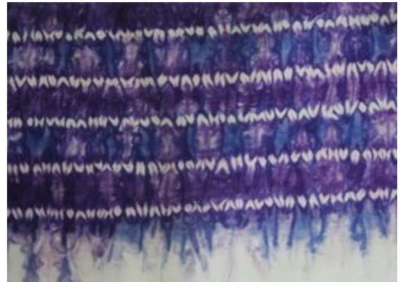
Fig. 6. Balimbur Dragon motif

The variety of Naga Balimbur motifs is a wavy line that is arranged regularly and repeatedly in a symmetrical manner so that balance and unity can be realized. The application of one type of motive creates a monotonous impression, but it does not appear to be a form of contradiction. This is because what is presented is only a wavy line, namely the Naga Balimbur motif, which creates a harmonious impression. This motif variety can be seen in the following picture: