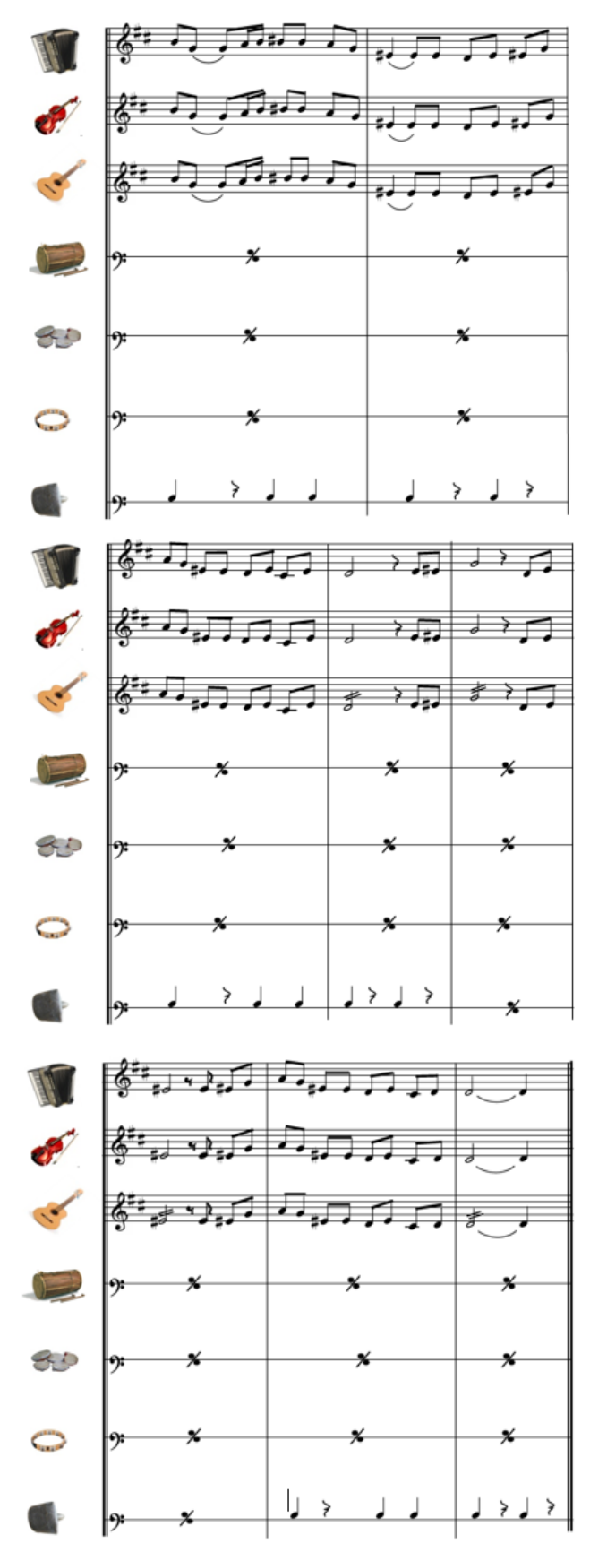
Fig. 4. Block notation theme 2