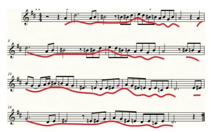
Fig. 5. Core Melody theme 2

the writer took a snippet of melody theme 2. Note the contour of melody below!