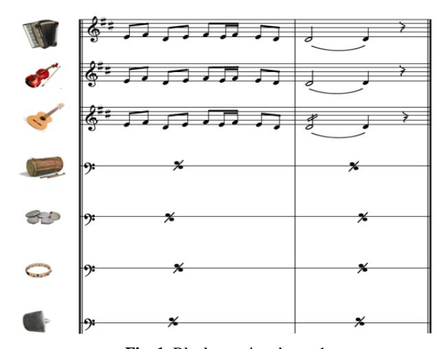
Fig. 1. Block notation theme 1

Based on the explanation of theme 1 section, explanation related to the the form of its melodical structure is explaned as follows: