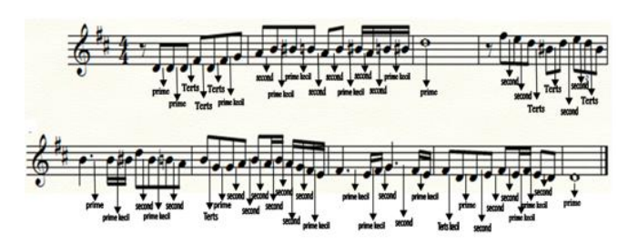
Fig. 3. The quality of melodic interval on theme 1

Interval is a distance between two tones. The following description of the melodic interval on part of theme 1 and its quality. To clarify it, Figure 3 is the explanation.