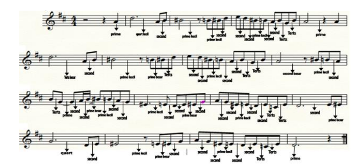
Fig. 6. Melodic Interval theme 2

The following description of the melodic interval on part of theme 2 and its quality. To clarify it, note the notation below!