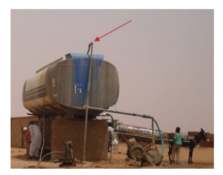
Figure 2 Tank of well 1 with the modified radiator (red arrow).

Table 4Prevalence of water-associated diseases in Um-Baddah Nevachah among respondents during the study period