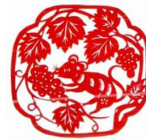
Fig. 1. The Rat Steals Grapes. 1

various forms, and created rich and original rat patterns. Rat-themed folk art works mainly include The Rat Steals Grapes (see "Fig. 1"), The Rat Climbs the Lamp Stand (see "Fig. 2"), The Rat Steals Pumpkin (see "Fig. 3"), The Rat Steals Chinese Cabbage (see "Fig. 4"), The Rat Offers Birthday Felicitations (see "Fig. 5"), The Rat Bites the Heaven (see "Fig. 6"), and The Rat Marriage (see "Fig. 7"). The witty rat patterns created by life-loving folk artists have been handed down to this day as the expression of folk life message. These lively and imaginative rat patterns fully reveal the wisdom and unrestrained imagination of ancient people, and betray unique art expressive force and affection.