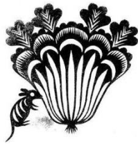
Fig. 4. The Rat Steals Chinese Cabbage. 4