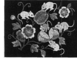
Fig. 9. The Rat Eats Watermelon. 9