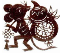
Fig. 5. The Rat Offers Birthday Felicitations. 5