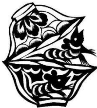
Fig. 6. The Rat Bites the Heaven. 6