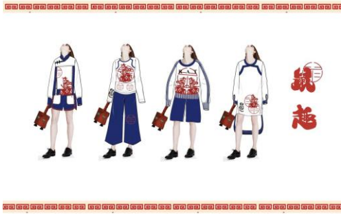
Fig. 12. "The Funny Rat" series garment design (painted by the author).