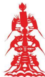
Fig. 2. The Rat Climbs the Lamp Stand. 2