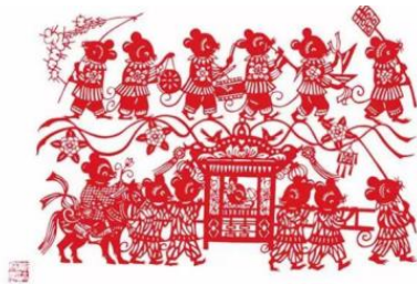
Fig. 7. The Rat Marriage. 7

Chinese rat pattern has peculiar modeling features and artistic characteristics, humorous signs, distinctive texture, and prosperous symbolic meanings. In modern and contemporary works created by folk artists, the new images of rat emerge endlessly. Moreover, the pattern of rat also appears more abundant and exquisite and carries forward people's infinite expectations for the future.