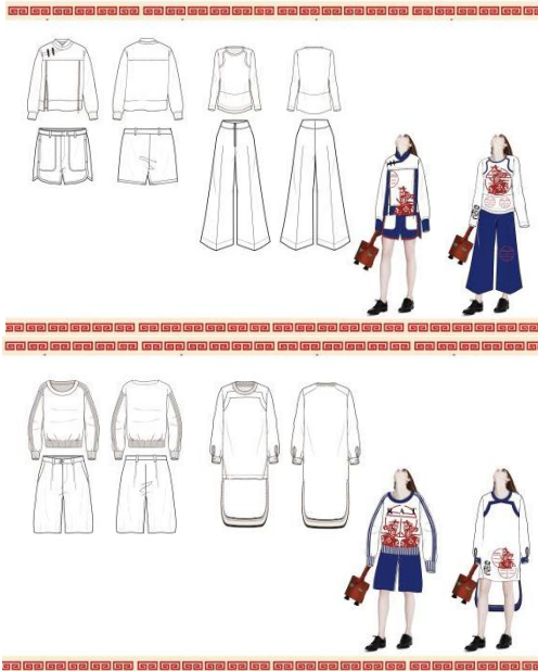
Fig. 13. Costume design diagram (painted by the author).