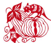
Fig. 3. The Rat Steals Pumpkin. 3