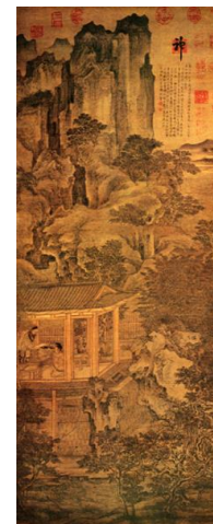
Fig. 1. "Gaoshi painting", the Five Dynasties, Wei Xian.

Chinese traditional painting is inseparable from Chinese philosophical culture and cannot be separated from the concrete manifestation of the five elements of traditional philosophical thoughts in Chinese paintings. The relationship between Chinese traditional five elements philosophical thoughts and Chinese painting art has a long history, appreciating Chinese traditional paintings with the theory of five elements. Especially the painters of the Tang and Song Dynasties pay more attention to the five elements of painting, such as the Five Dynasties Jing Hao's "Kuangu painting", the "Gaoshi painting" of the Five Dynasties Wei Xian, the "Gui Zhichuan migration painting" by Wang Meng of the Yuan Dynasty, the "Tiange painting" of the Southern Song Dynasty, and the "Fishing Son" of the Northern Song Dynasty Xu Dao Ning, etc., all of which are "the yin and yang five elements in the painting". For example, the three works of "Gaoshi painting", "Kuangu painting" and "Tiange painting" are taken as examples: ("Fig. 1")