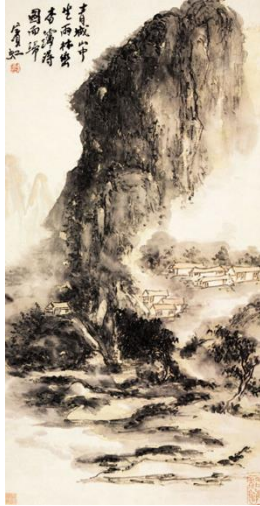
Fig. 5. "Landscape Works", modern, Huang Binhong.

gas in the picture is overflowing and overflowing, it can be controlled and suppressed by layered ink and ink staining, that is to say, by increasing the thickness of the "soil" in the picture, the overflowing of the "water" in the picture can be restrained. The same is true of the saying "water comes to soil to cover up". Of course, if too much emphasis is placed on the depth of the "earth" of the picture, for example, the layers of ink in the screen are too cumbersome, it is easy to lose the charm of the "water" of the picture. Therefore, the relationship between the "metal generates water" and "soil restricts water" must be controlled in the process of Chinese painting creation.