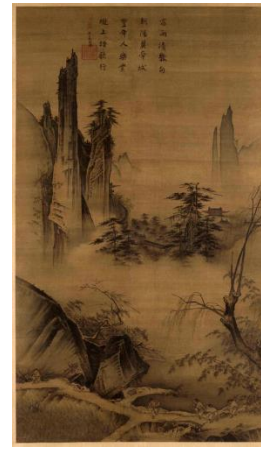
Fig. 3. "Tiange painting", the Southern Song Dynasty, Ma Yuan.

"Kuanglu painting" is a landscape painting of the Five Dynasties Jing Hao, which shows the scenery of Lushan Mountain in Jiangxi province. The upper part of the picture depicts the strange peaks of the peak slopes that have been scraped by the knife. The waterfalls flow down the mountain and merge into streams and flow into the bottom of the mountain. There is a mountain road in the middle of the picture. A small house is located in the middle of the mountain. There are small trees on the ridge, and the foot of the mountain is paved. The bridge twists and turns, and it is hidden in the forest. Surrounded by trees, it is magnificent and beautiful. Looking down the mountain, there are people riding on the mountain road. There are small boats and fishermen near the water. The picture is full of natural beauty and life. From the analysis of the five elements, the peak of the distant view of the picture is "fire" shape, and the mountain path of the middle scene is "wood" shape. The whole picture shows the five elements theory of "wood making fire". ("Fig. 3")