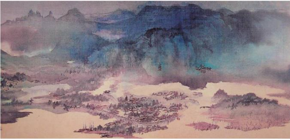
Fig. 6. Part of "The Yangtze River Miles", modern, Zhang Daqian.

Therefore, all kinds of discomforts in Chinese paintings are problems in the balance and coordination of the five elements of paintings. Chinese painters can use the five element relationship to make up for and correct them. The five elements of the theory of Chinese painting, in fact, the ultimate goal is to make all aspects of Chinese painting can be moderate and peaceful, using the relationship between the five elements, so that the elements between the various aspects of the painting are interdependent, between the various elements. The contradictory relationship is harmonious and unified. The five elements of the theory can help and create harm to Chinese painting. It can be destroyed or suppressed. Only by adjusting the application of the five elements principle to the best condition can Chinese painters really make their painting become a good work.