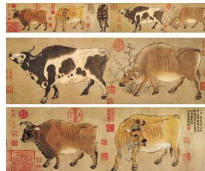
Fig. 4. "Five Oxen", the Tang Dynasty, Han Fang.

The "metal": from the content theme of Chinese traditional painting works, animal painting and figure painting which express the phenomenon of human and animal life belong to "metal"; From the point of view of the intention of the painting works, the concept of "the bleak land", which expresses the bleak and comfortable spirit, belongs to "metal", and from the aspect of the composition of the picture, the composition of the semicircle and the circle belongs to the "metal", and from the aspect of the composition of the picture, the semi-circular and circular composition belongs to "metal". From the point of view of the expression and expression language of painting, the painstaking reappearance of "craftsmanship", which is detailed and detailed, belongs to "Jin"; according to the ink color technique of painting, "pen power" belongs to "metal" in pen method, "Jiao ink", "dry ink" and "persistent ink" in ink method belong to "metal", and "white" color in design color belongs to "metal". ("Fig. 4")