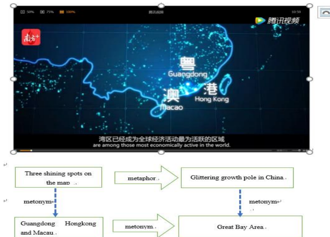
Fig. 1. Projection process of a new growth pole in the Bay Area.

With the help of metonyms, the propaganda film depicted a highly developed traffic system by presenting the Hong Kong-Zhuhai-Macao Bridge and the high-speed rail (part & whole), and metaphorically a rapidly developed and rising