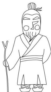
Fig. 1. First draft of line drawing of the visual image of Mozi.