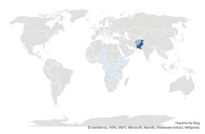
Figure 1 \mid A world map showing countries where pilgrims are required to have poliomyelitis vaccination.