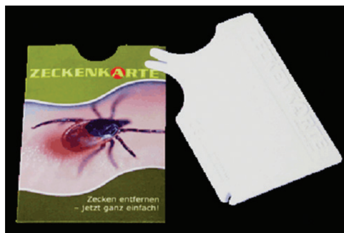
Figure 3 | “Tick card” to be used for removal of ticks from the skin (size of credit card).

As there is no effective treatment for TBE, prevention is paramount. Theoretically, reduction of exposure is the first line of defense, but the options for tick avoidance at best have a limited effect [17]. Repellents offer no more than a moderate effectiveness [18]. Although battle-dress uniforms impregnated with permethrin