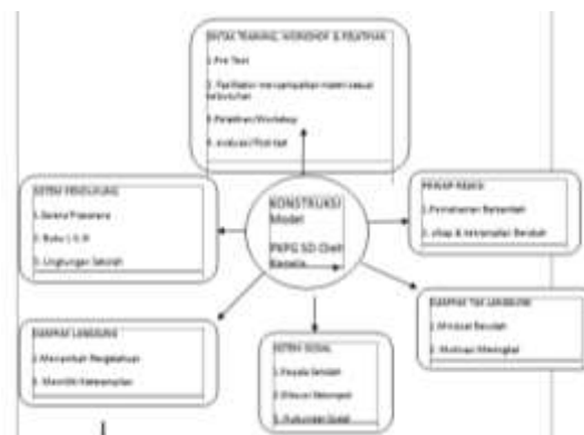
Fig. 3. Construction Model PKPG

Construction development Model of Pedagogic Competency Master (PKPG) ELEMENTARY School by the principal in PKG