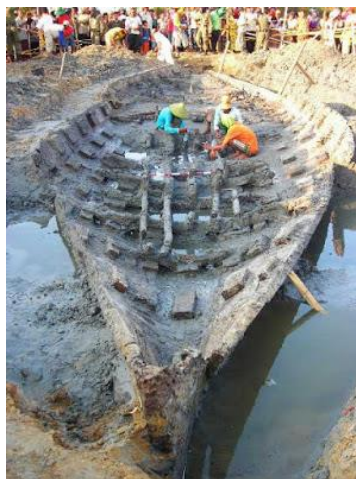
Fig. 6. Ancient Boat Village of Punjulharjo, Rembang

The archaeological evidence proves that in 2008 in Punjulharjo village, District of Rembang, Central Jawa, an ancient boat at the 2 meters depth with 17,9 meters length and 5,6 meters width, and weighs 60 tons was discovered (figure 6). Axes, bone, carved rods, pieces of pottery bowls were found inside the boat. A team of archaeologists from the Yogyakarta Archeology Institute conducted a radiocarbon analysis of boat fibers sample in Beta Analytic Radiocarbon Laboratory, Miami, Florida, USA. The results indicate that the boat came from VII-VIII century AD ( https://indocropcircles.wordpress.com/2012/02/13 ). The size of the boat was large enough to be a sign that the boat was used for long-distance shipping and described that the Muria Strait was large enough to be a trade route of the time. In the sixteenth century AD, there had been sedimentation with the bird's foot morphological signifier which became a signified that the coastline had shifted as far as 30 km.