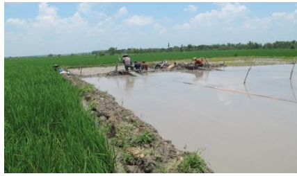
Fig. 4. Rice field environment at the Medang Kamulan Site