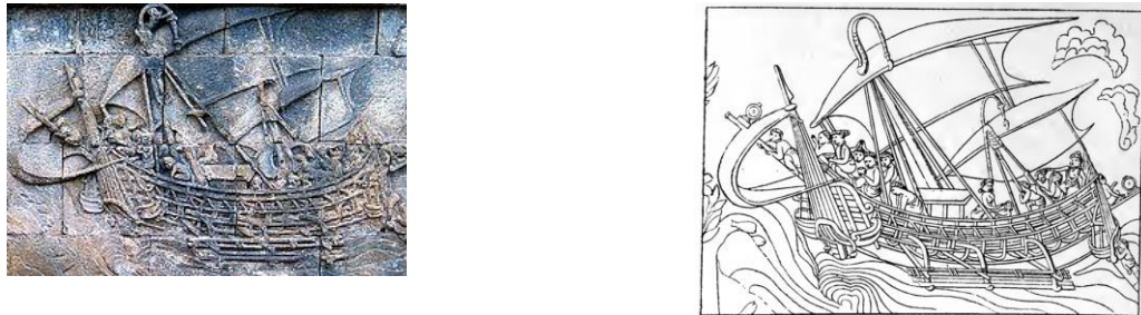
Fig. 7. The shape of a boat from the Relief of Borobudur Temple

book Kuo-chi (record of Buddhist countries). On his way, the ship he boarded was forced to dock in Yeh-po-ti (this place was connoted with Yavadwipa or Java). The ports in Lasem, Rembang, in the seventh century is estimated to be visited by merchants, it is supported by the fertile hinterland condition and rich with a selling commodity, making it an important trade route (Sulistiyono, 2017). This means that at that time, Java Island was separated with Mount Muria and the condition of Muria Strait was large enough to trade and to build some ports along the north coast of Java. An ancient boat from Punjulharjo Beach with a large enough size proves that boat transportation has an important role as a liaison between regions. The description of a boat in the variety of forms can be traced through reliefs carved on the walls of the Borobudur Temple (figure 7).