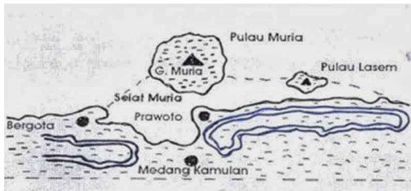
Fig. 2. Medang Kamulan on the north coast

According to the research conducted by Hussein and Barianto (2016), the coastline of the north coast of Central Java in the VIII century AD was still protrudes towards Purwodadi, it is estimated that Medang Kamulan settlements (Figure 2) is already existed. Furthermore, according to Husein (2016), in 16th century in the golden era of the Demak Sultanate, the coastline was thought to have shifted to the current city of Demak (Figure 3). At that time, the forward progress of the coastline as far as 30 km occurred within a period of about 800 years, with sedimentation speeds averaging of 40 m/year. Until now, the estuary of the two rivers is still active in sedimentation which pushed forward the coastline between Jepara and Semarang, characterized by the bird's foot delta morphological type. On the other hand, the remains of Muria Strait which is shallow and turns into an alluvial land also forms the flow of the Juwana River, which flows northeastward across Pati and forms a cusped delta type at the west of Rembang (Husein et al., 2016).