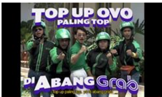
Fig. 2. Example of paralinguistic element

The next aspect is language and paralinguistic. The language element that looks most prominent and is the core of this advertisement is at the end which appears along with the following visuals.