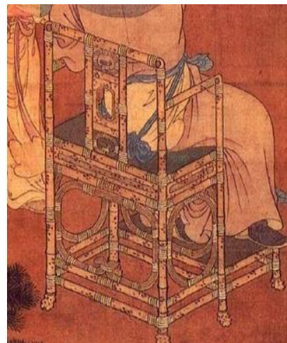
Fig. 5. Part of "18 Bachelor's Figure Painting" drawn in Song Dynasty.

If rose chair is continuously simplified from the perspective of longitudinal development, it is also affected by the overall development trend of furniture in the same times such as in Ming Dynasty from the perspective of horizontal development.