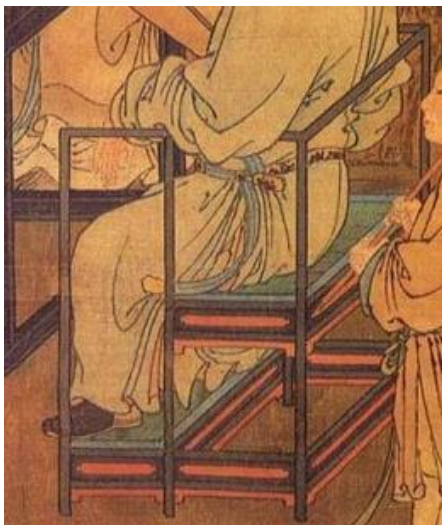
Fig. 4. Part of "18 Bachelor's Figure Painting" drawn in Song Dynasty.

Seen from the evolution of rose chair, the general structure follows the narrow and squared framework, while the other aspects are further simplified. The predecessor of rose chair shown in paintings of Song Dynasty of had pedal and the texture of pedal and seat surface were both in rattan-surface soft drawer structure. As for those shown in paintings after Ming and Qing Dynasties, few of them had pedal and the sizes of armrest, backrest and seat plate were all reduced till a general style was produced in Qing Dynasty.