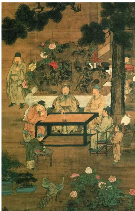
Fig. 7. Part of "18 Bachelor's Figure Painting" drawn in Song Dynasty.

It can be said that rose chair vividly reveals the otherworldly quality and elegant aesthetic taste of literati and officers; in the other way round, it can also be said that it was precisely their love and mass use that grants the rose chair the pure and elegant cultural character and traditional Chinese cultural connotation.