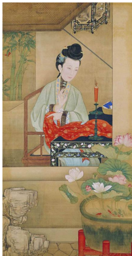
Fig. 6. "Sewing Under the Candle Light" drawn in Qing Dynasty.

woman in the painting sits in a rose chair with small, exquisite and elegant shape made of fine material, and the armrest is not higher than the table face. The backrest is empty and cannot be leaned on. The woman sits on the 1/3 part of the chair. Under the illumination of the candlelight, the dignified and virtuous image of an ancient Chinese woman is vividly displayed; but it can be intuitively felt that this sitting posture is sufficiently elegant but cannot get body relaxed. Therefore, the female characteristics reflected in the form of rose chair is not so much a female characteristics granted by the nature as a requirement or shackle that male adds on female in the patriarchal society. Therefore, it is believed that the social rules hidden behind the inflexible image of those chair are precisely the fundamental source of inspiration for the design aesthetics of rose chair. From another point of view, compared with circle chair more in line with the ergonomic requirement, rose chair undoubtedly abandons the pragmatism of the product and pursues the formal aesthetics to a greater extent. This is a manifestation of the old feudal ideology's coercion on female's characteristics. The initial generation of rose chair is not so much a reflection of female's natural beauty as for catering to male's regulation on female.