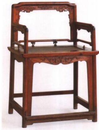
Fig. 1. Rose chair made of rosewood in Ming Dynasty: collected by Mrs. Chen Mengjia.

backrest is relatively low and is only half of the height of the common chair backrest. The backrest, armrest and seat plate of rose chair are perpendicular to each other, and are composed of a plurality of narrow and long wooden strips. The whole looks like a rectangular box and the volume is relatively low. And few large piece of wood may be used; even the seat plate may be replaced with other materials. Therefore, this chair looks very small and beautiful, and just has a little bit of decorative pattern for decoration.