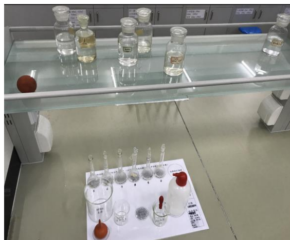
Fig. 1. Chemical positioning plate real map.

experimental class. The upgraded version of the chemical positioning board has the advantage of not requiring the size of the item and does not require to be familiar with computer and design software. As long as the students understand the experimental process, they can easily make the corresponding chemical positioning plate, and they can find the positioning sticker that needs to be adjusted during the trial and reposition it. "Fig. 1" is a real-life picture of the positioning plate used by the students in the instrumental analysis experiment class. This positioning plate requires professional designers to position the measured glassware on the A3 paper (see "Fig. 2"), and then plastically seal it. The lower right corner of the positioning board is the content information of the experimental participants. Students use the Mark pen to sign on the plastic film. After the experiment, the names can be erased with ethanol, which can achieve the purpose of repeated use. On the upper stage, there is no reagent placement for the positioning plate, which is a reference sample for the typical laboratory reagents.