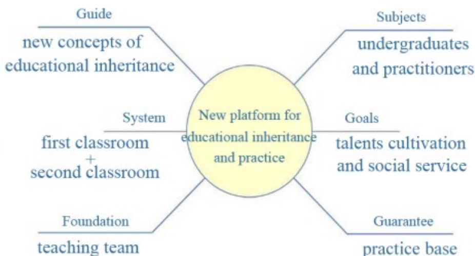
Fig. 2. A New Platform for Educational Inheritance and Practice

universities are supposed to foster a dynamic and creative group of inheritors, contribute to the inheritance of development, and start a new path [5].