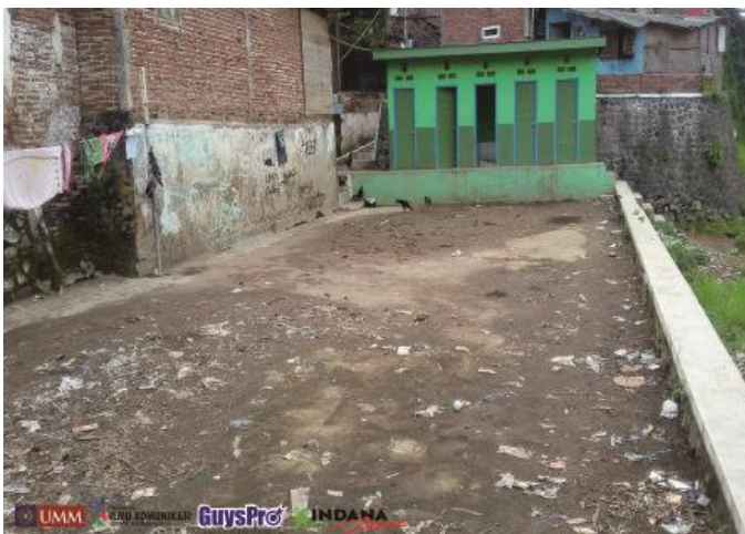
Fig. 2. Toilet of Jodipan Hamlet before the transformation.

Although has a bad environmental and sanitation condition, the Jodipan hamlet community tend to has a good social life. Most of Jodipan’s community is native inhabitant who has been living there for a long time. Apart from having lived in Jodipan hamlet since childhood, the Jodipan’s hamlet that located in the center of the city is the reason why the community tend to live there. Jodipan hamlet community still has social and cultural values that reflected in the structure of the community which still has community assemblies, congregations and community associations that engaged in social affairs. It is also supported by the people who want to work together in every citizen activity. The habit of mutual cooperation that has been going on for a long time certainly reflects the harmony that exists in the community of Jodipan village. Every time a community activity takes place, community participation is very high.