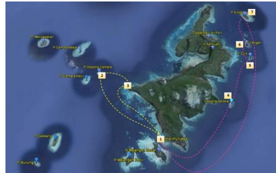
Fig.1. Zones and maritime tourism routes of the Karimunjawa.

The feasibility of the next investment is measured by using a comparison of benefits and operational costs. Criteria for the value of BC < 1 , the investment is not economical / not feasible, and BC > 1 means that the investment is feasible. If B / C ratio = 1 said that investment is marginal (no loss and not profitable). Economic analysis graph can be seen in figure 3.