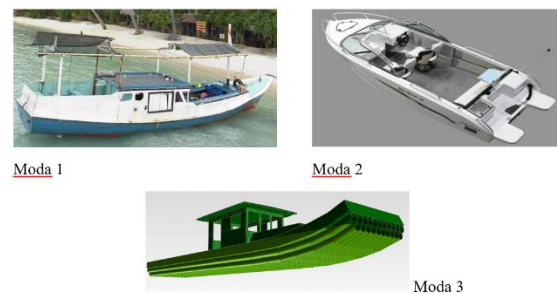
Fig.2. Mode of maritime tourism transportation (mode 1, 2 and 3)