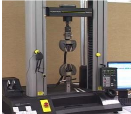
Fig 7. Machine Tensile test.

The machine tensile test have many characteristic likes: mechanical property test, elongation, force graph and output characteristic base data and result.