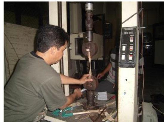
Fig 8. Tensile testing process.

Specimen test bamboo apus have to characteristic of material (thinness and shortness) not like specimen steel and hardwood.