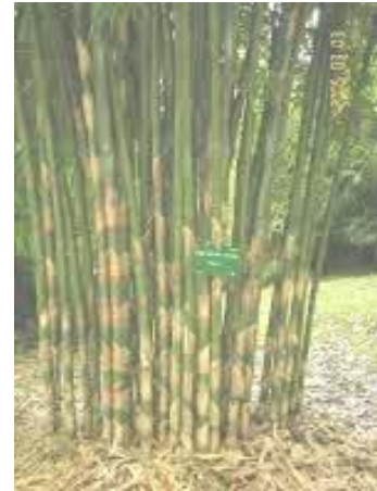
Fig 2. Popular bamboo in Indonesia

The advantages of traditional bamboo construction have actually been proven in the construction of houses in the earthquake area, where post-disaster (earthquake) house construction with a bamboo or wood frame system is still intact standing while many buildings with masonry or concrete frame construction have collapsed meaningfully, this construction is very suitable for use in potential earthquake areas in Indonesia because they are more elastic to earthquakes [2, 3].