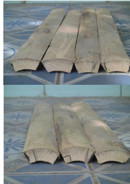
Fig 4. Raw material.

This method will test the mechanical properties of [5] bamboo apus (Gigantochloa Apus) on tensile, specific gravity with the following treatments: