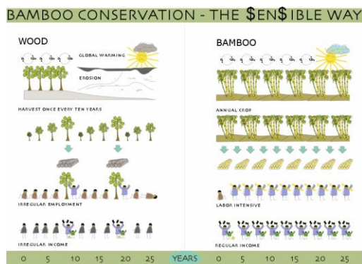
Fig 1. Comparison of the age of harvesting bamboo and wood

Wood supply for industry has dropped dramatically from 35 million m 3 per year to 7 m 3 [1]. The use of bamboo as a plywood material has been introduced by Guisheng (1985), Bamboo Information Centre (1994), Subiyanto and Subyakto (1996). Bamboo layers have high strength against abrasion and bending moments. The resistance of bamboo floors to abrasion has been studied by Mohmod and his friends (1990). Bamboo is a renewable (renewable) building material, fast harvesting, abundant potential and not yet maximally used, see Fig 1.