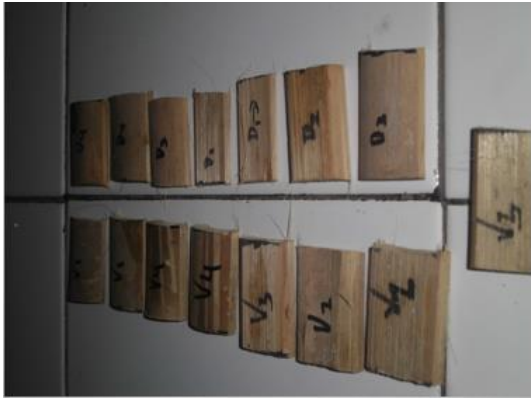
Fig 5. Specific gravity test specimens