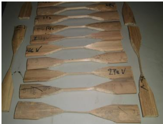
Fig 6. Tensile test specimens.

The choice of this type of bamboo apus is based on bamboo that is cut during the dry season. Bamboo is bought on the market. Bamboo tensile testing is carried out on the base, middle, and top. The length of bamboo is selected at least 12 m, cut 10% at the base, 20% from the top. Bamboo treatment for tensile testing by oven drying and nature drying. Tensile testing equipment is of international standard and is well calibrated, see Fig 3 and 4.