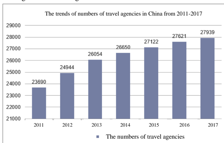
Fig. 1. The trends of numbers of travel agencies in China from 2011-2017.

As shown in "Fig. 1", from 2011 to 2017, the number of travel agencies increased from 23,690 to 27,939, showing a continuous growth trend, but the overall growth rate is declining.