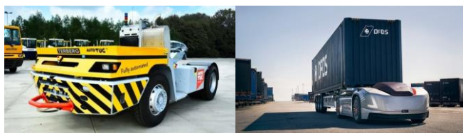
Fig. 1. Examples of Automated Yard Tractors (AYTs).

This paper therefore addresses how the transition of a (non-automated) brownfield terminal to a terminal with AYT's and mixed traffic is impacting (i) design (e.g., terminal layout planning), (ii) operational control and (iii) digital infrastructure. The paper proposes a (digital) transition process that ensures efficient, safe, secure and future-proof container handling.