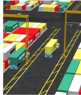
Fig. 3. Close-up of the three lanes between the stacks.

rules. However, when YT's are automated, there is no driver to take control. Comparable to currently deployed ACT's with AGV's, we propose to use a digital control system for the AYT's to replace the tasks that were previously taken care of by the driver (e.g., giving way, steering and stopping). Specifically, this control system should mitigate safety risks due to the unpredictable behavior of the external (manual)