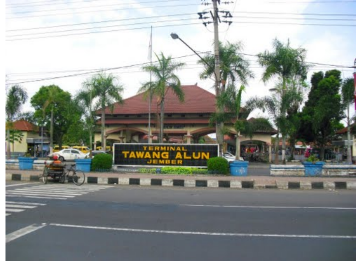
Fig. 1. The front of Tawang Alun terminal [2]

environmental damage. The environmental damage caused by transportation activities that also occur in terminals [2].