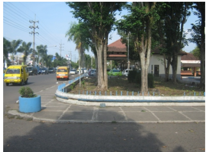
Fig. 2. Access to Tawang Talun terminal [2]

This study conducted an analysis of the influence level of green terminal performance factors that have been carried out previously by Sedayu (2016)[2]. Sedayu carried out the description of the performance satisfaction level of Tawang Alun Green Terminal in Jember. The method used is multiple linear regression analysis that determines the influence level between the 12 performance factors. The results of research conducted by Sedayu generated 12 performance factors