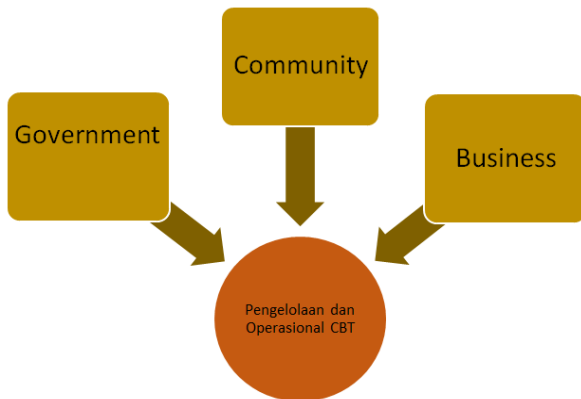
Fig. 1. Tourism Stakeholder – Threefolding [3]

Academics identified tourism stakeholders as Penta Helix which consists of: Academics, Business, Government, Society and Media [8]. Another model named Threefolding was developed by Perlas [3] which comprises Society, Government, and Business (Fig. 1). This research on developing a CBT Stakeholder Model is constructed base on the model developed by Perlas [3], which are all parties directly involved in the operation of CBT.