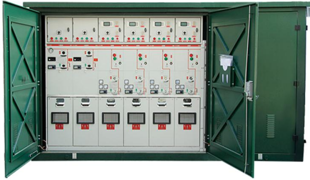
Figure 1. Structure of Box Transformer Substation

of the high voltage system is delivered to the low voltage system[4], as shown in Figure 1.