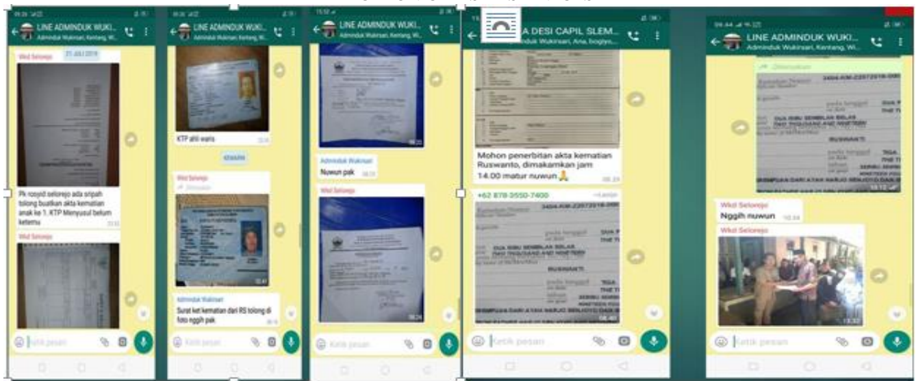
TABLE 4. THE APPLICATION FOR MAKING THE DEATH CERTIFICATE IN WUKIRSARI VILLAGE THROUGH ELECTRONIC-BASED SERVICES

Data Source: Wukirsari Village Adminduk Service Data