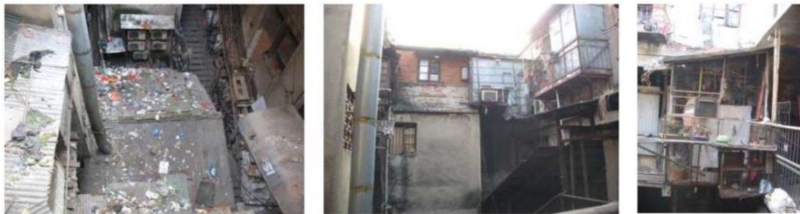
Fig. 3. Built environment map.

simple public toilet was set up in the corridor. These new partitions blocked out most of the sunlight, leaving the corridors in dim light. Since then, due to the increasing population, the situation of privately built extensions has become increasingly serious. In addition, with too limited space to place their furniture and sundries, the households occupied the aisle. Due to the complexity of the building, traffic is crowded, household garbage is thrown away everywhere, and no one managed it. All these phenomena lead to great security risks (as shown in "Fig.3").