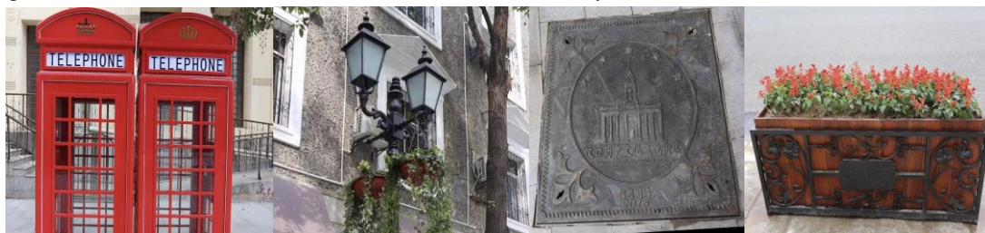
Fig. 4. Street utilities.

combine tradition with modernity, which is consistent with the style of the historical blocks.