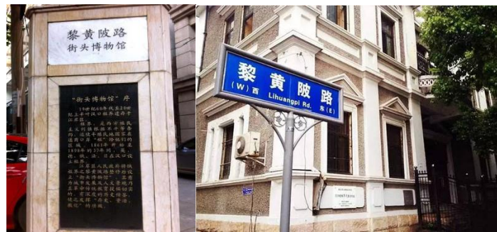
Fig. 2. Lihuangpi Road.

At the first stage, problems emerged. In the early days after the founding of the People's Republic of China and during the Cultural Revolution, the increasing population led to a shortage of housing, and the use of office space as a residential building became common. In order to meet the living habits, people have transformed the office space where they live, dividing the whole space into many small spaces by building partitions in the interior of the building. In order to expand the utilization rate, in one room lives a family, and in one floor live a dozen of households. At the same time, a