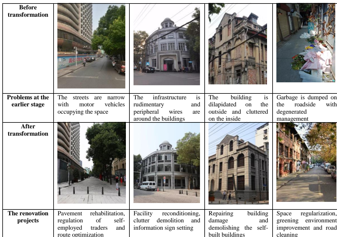
TABLE I. COMPARISON OF THE STATUS OF LIHUANGPI ROAD BEFORE AND AFTER THE TRANSFORMATION

Slow thinking concept includes the theory of "reborn" and "reuse". The term "Reborn" is often translated as "regenerate", which means to give new life to historical buildings through moderate renovation and adjustment. "Reuse" refers to the directional and planned transformation of historical buildings according to their urban environment, social, economic development and cultural characteristics, so as to realize and endow them with functions in the new era while retaining their morphological characteristics and value as cultural heritage. 5