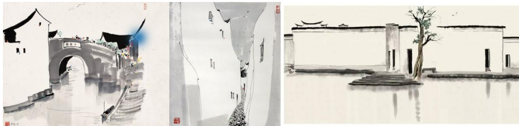
Fig. 2. Works by Wu Guanzhong.

Chinese)" and "fragrance of books (shu xiang in Chinese)" are homophonic, so the brand name is "Dixi Book Alley ('di xi shu xiang' in Chinese)". By studying the expression techniques of some contemporary Chinese artists, the visual realization techniques of Mr. Wu Guanzhong are selected as the reference of logo design form (see "Fig. 2"). Mr. Wu Guanzhong's paintings converge and blend eastern and western art. In his early years, he was trained in Chinese culture and art, but after three years of studying abroad in Paris, he entered the world of Western aesthetics. He created his own unique style in composition, and techniques, which is of great significance in the history of Chinese painting. In the process of learning his works of the middle and late period are mainly used for reference and inspiration.