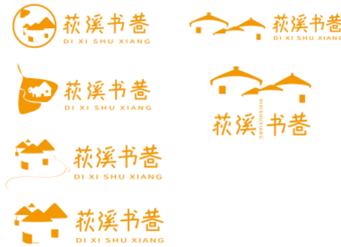
Fig. 3. Design sketch with granary as main element.

After learning Mr. Wu Guanzhong's works and articles, the researchers imitated his picture composition, combined with the modern popular vector illustration, simplified the granary, and made use of the concept of positive and negative shapes. Three "Windows" of different sizes are added below the roof of the sign to add a sense of vivacity. The "windows" is not simply square, but has radiants of a