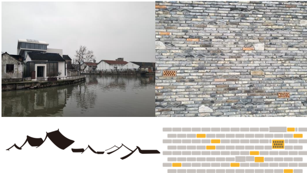
Fig. 8. Auxiliary graph.

selected. With a strong flexibility, the wall brick can change according to changes in the layout; the combination of eaves group and roofs of the granaries can be depicted by use of positive and negative shape, which gives a feeling similar to that in Wu Guanzhong's works. The application of the two endows the picture with the characteristics of Jiangnan water town, which is smart and lively (see "Fig. 8").