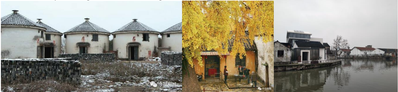
Fig. 1. Outlook of Taiping Book Town.

library has also been built, the overall shape of which is modern and relatively simple though, but is integrated with the architectural characteristics of white wall and black tile in Jiangnan water town; there are also some traditional farm tools left over, as well as some models of traditional customs.