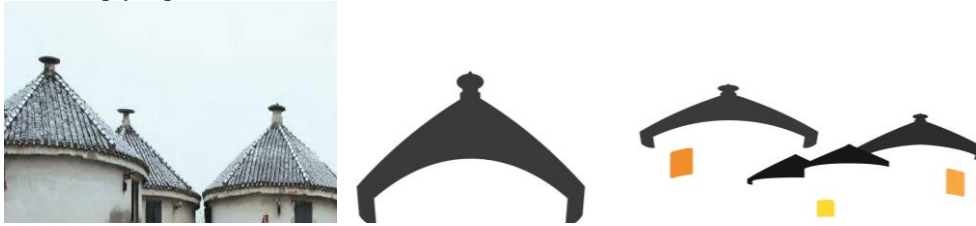
Fig. 4. Visual elements extraction from the granary.

certain degree on the upper and lower edges, so as to increase the volume of the negative shape and make the positive shape more prominent. The roof of the granary is conformal. So the conformal roof and windows highlight the negative shape of the wall, forming a sense of space (see "Fig. 4").