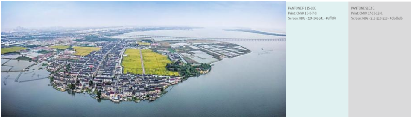
Fig. 7. Assistant Color.